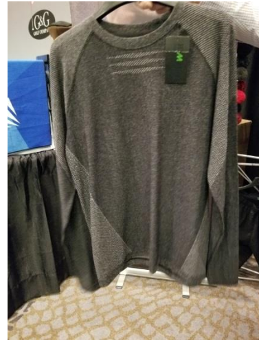
A new seamless line of Work-Out Wear from Fersten Fitmatics that is the same fabrication as Lululemon. New T-Shirt, Long-Sleeve, Shorts, Full-Zip and Hoodie. MSRP from $40.

These are just a few of the new apparel items we saw. Too much to share here but please don't hesitate to contact us for more information or pop into our showroom to see the new samples.