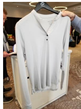
The New North End Stretch Performance Pullover. Fabric is a blend of Polyester, Lyocell and Spandex Jersey that feels like Ring Spun Cotton. MSRP $60.00.