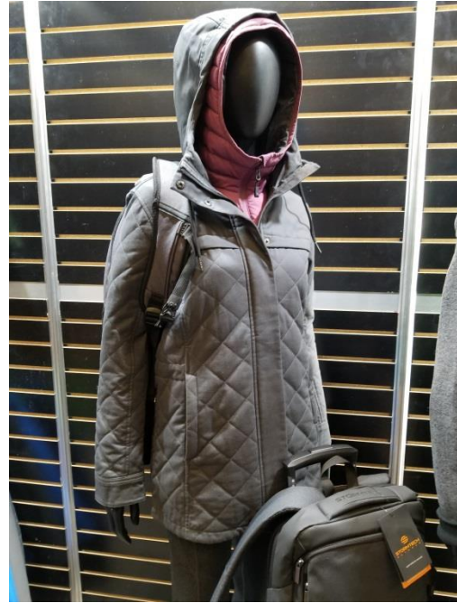
Stormtech's New Bushwick Quilted Jacket. MSRP $180.00.